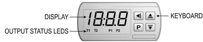
Fig. 2 – Front Panel

The signaler P1 at the front panel of the controller will light up when the control output is activated. The signaler P2 light up when the booster output is activated.