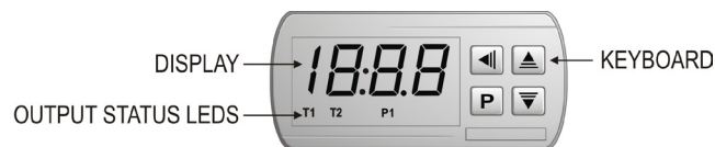
Figure 2 – Front Panel

The signaler P1 at the front panel of the controller will light up when the control output is activated.