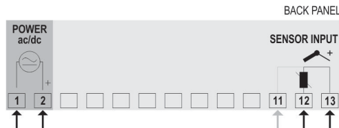
Fig. 1 – N320 terminals

Fig. 1 below shows the temperature meter connections to sensor, mains and outputs.