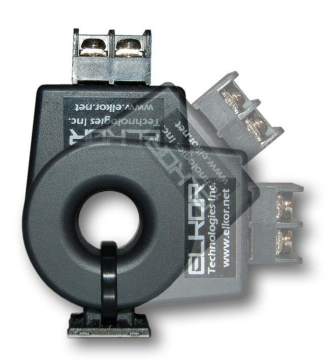
Mounting hardware for flexible surface mounting