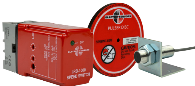
Standard System with: LRB1000 Speed Switch, 906 Speed Sensor, 255 Pulser Disc

An example of a standard LRB1000/LRB2000 system includes the LRB1000 DIN rail mount module, a 906 Hall Effect Shaft Speed Sensor, and a 255 Pulser Disc. Other shaft speed sensor and pulser target options are available.