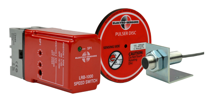
Standard System with: LRB1000 Speed Switch, 906 Speed Sensor, 255 Pulser Disc

An example of a standard LRB1000/LRB2000 system includes the LRB1000 DIN rail mount module, a 906 Hall Effect Shaft Speed Sensor, and a 255 Pulser Disc. Other shaft speed sensor and pulser target options are available.