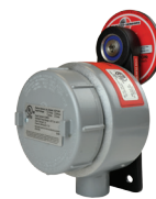
EZ-SCP Mounting Option