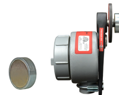
MM-2.00 Mounting Magnet Option (must be used with EZ-SCP)