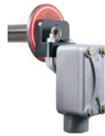
EZ-100 Mounting Option (917A)