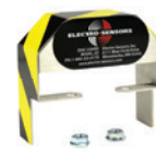
EZ-Mount Disc Guard