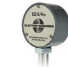
EZ-3/4in Mounting Option (916A)