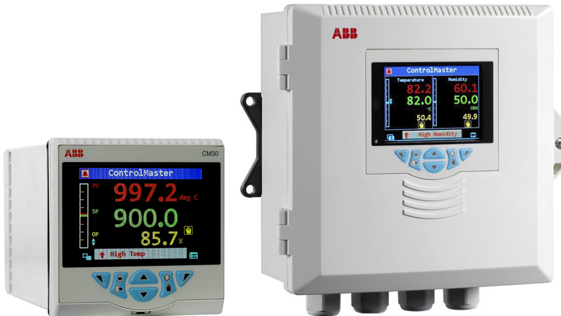
ControlMaster CM30 and CMF310