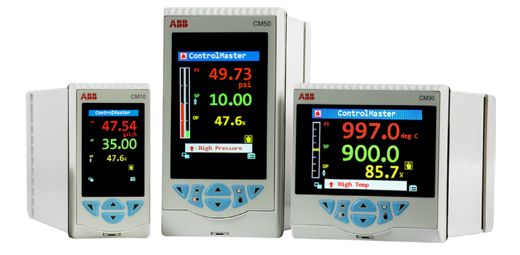
ControlMaster CM10 / CM30 and CM50 controllers